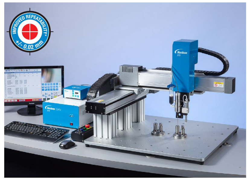
GV Series provides market-leading dimensional positioning accuracy and deposit placement repeatability. * X/Y calibration delivers best-in-class repeatability

A complete gantry automation system with vision for precise fluid application